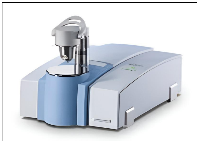
Fig 1: Infrared spectrophotometer Bruker

corresponds to deformation mode \delta(\text{OH}) of the water molecule. Another set is the set characteristic for the strong bands of acetate ligands appearing around 1,500\text{ cm}^{-1} . Four kinds of coordination of acetate groups are generally considered, according to the literature [19]: monodentate (I), chelating (II), bridging (III), and polymeric (IV).